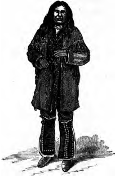
NORTH AMERICAN IN WINTER DRESS.

soon seated, and gliding over the blue waters. As we went along we passed an English ship belonging to Liverpool, from whom we received a salute. On arriving alongside the "Kent" we were received with a hearty welcome by all on board.